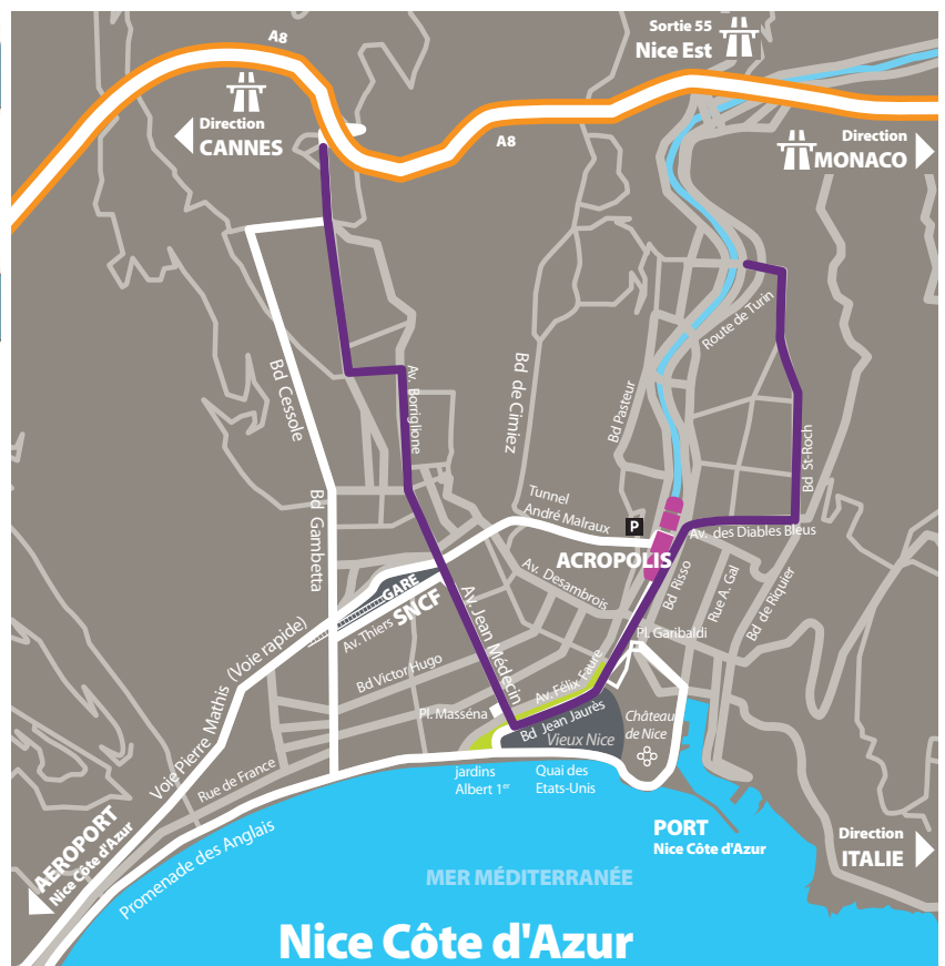
Tram line Line 1 route "Acropolis" & "Palais des Expositions" stops